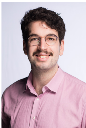
Mungo Trumble Lighting Design